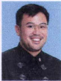
Hon. Christopher de Venecia Representative, 4th District of Pangasinan House of Representatives of the Philippines